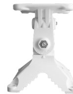
1x quickMOUNT PRO LHG