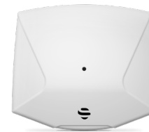
1x Anchor Vista DirectFive