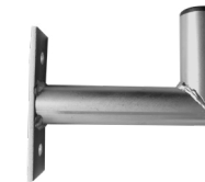
1x Wall Mount Metal Bracket