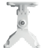
1x quickMOUNT PRO LHG