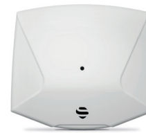
1x Anchor Vista DirectFive