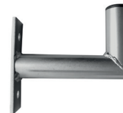
1x Wall Mount Metal Bracket